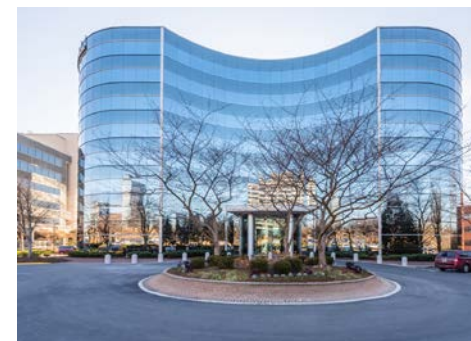
Tysons Corner, VA