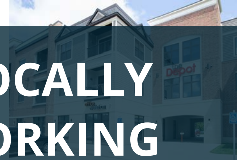
Cedar Rapids, IA