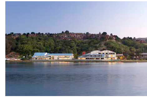
Mill Valley, CA